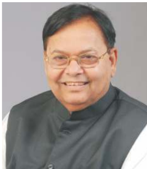
Dr. Patangrao Kadam